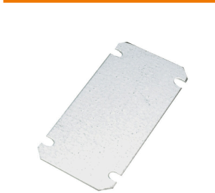
Mounting plates, 1.5 mm sheet steel, galvanised