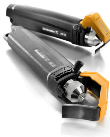
Sheathing stripper for PVC cables