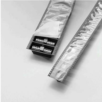
Packaged in tape-on-reel