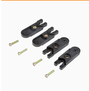
External attachment lugs 4-part set