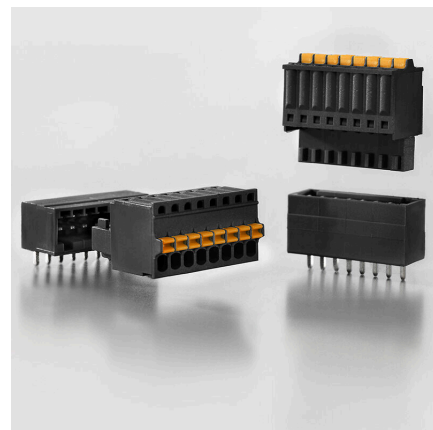
Flexible application Outlet direction: 90° and 180°